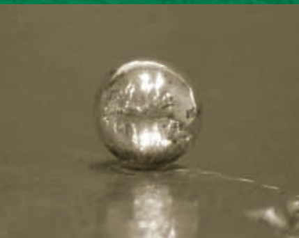
uncommon ball foot with acanthus leaves