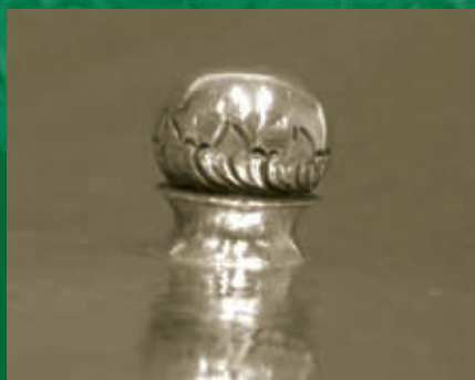
rare melon shaped foot