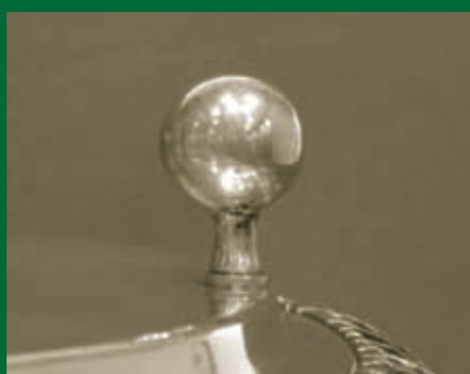
common flattened ball foot with tubular connexion