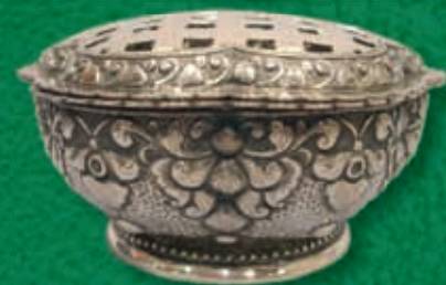
common ball foot